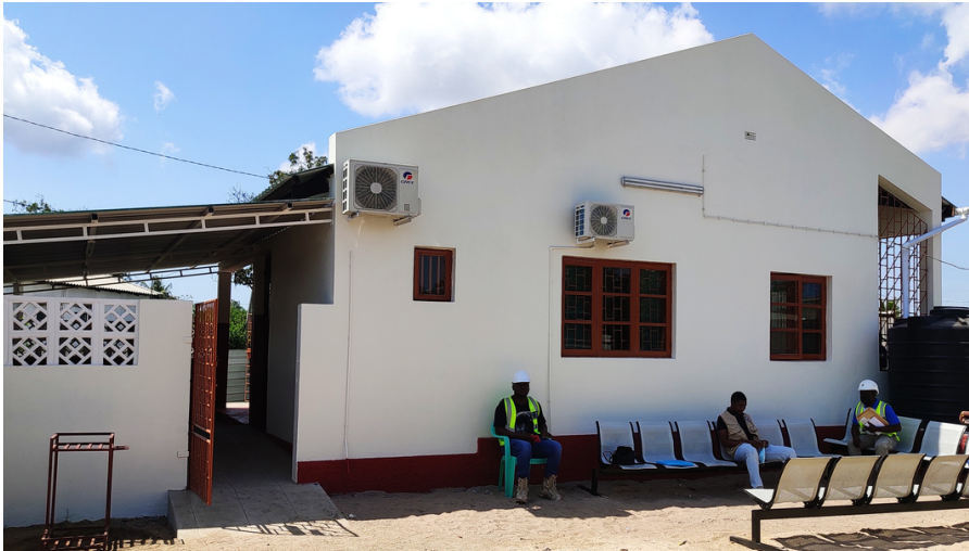
CHINAMACONDO HEALTH CENTRE

To help give your audience an overview, this section can include a brief description of the goal, its relevance to your sector or industry, and the specific sub-targets your organization is addressing.