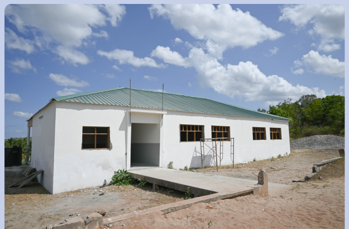
Primary School Macomia