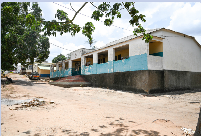
Macomia Health Centre