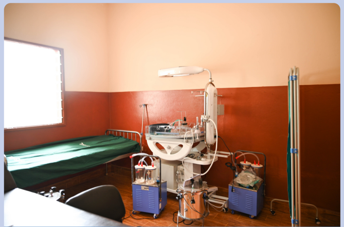
Macomia Health Centre and Maternity