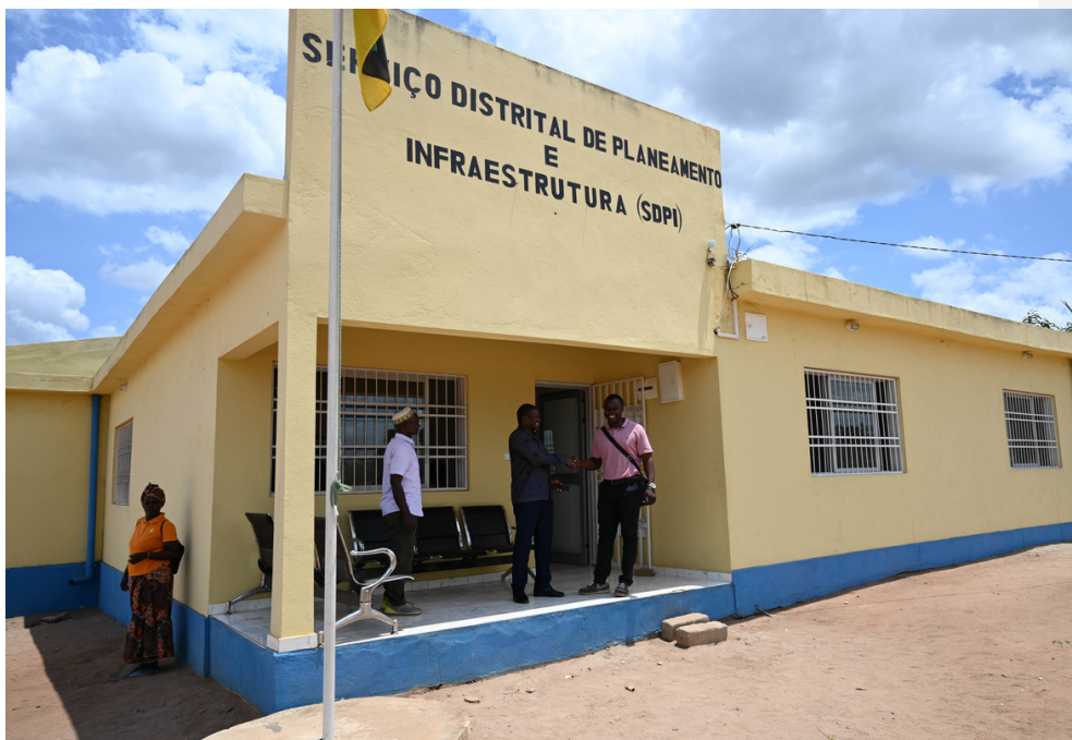
DISTRICT SERVICES FOR PLANNING AND INFRASTRUCTURE (SDPI)