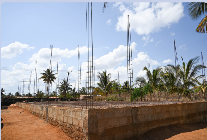
Xinavani Primary School