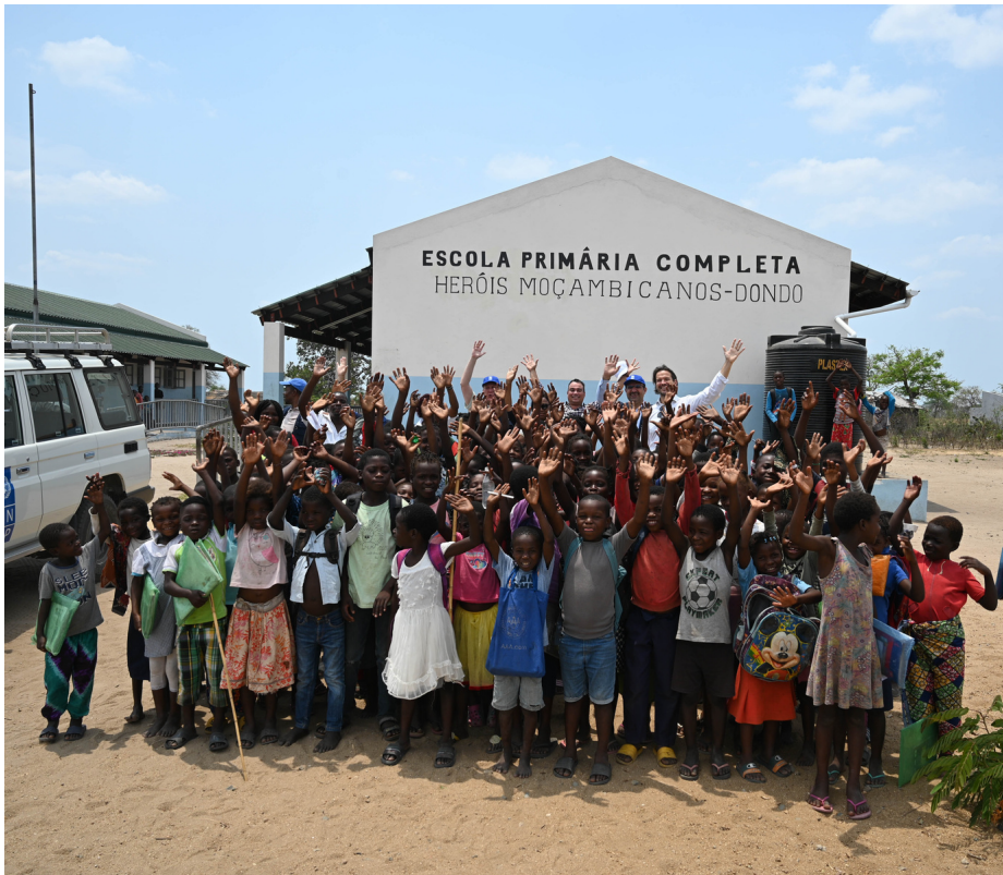
PRIMARY SCHOOL HEROIS MOCAMBICANOS - MUTUA