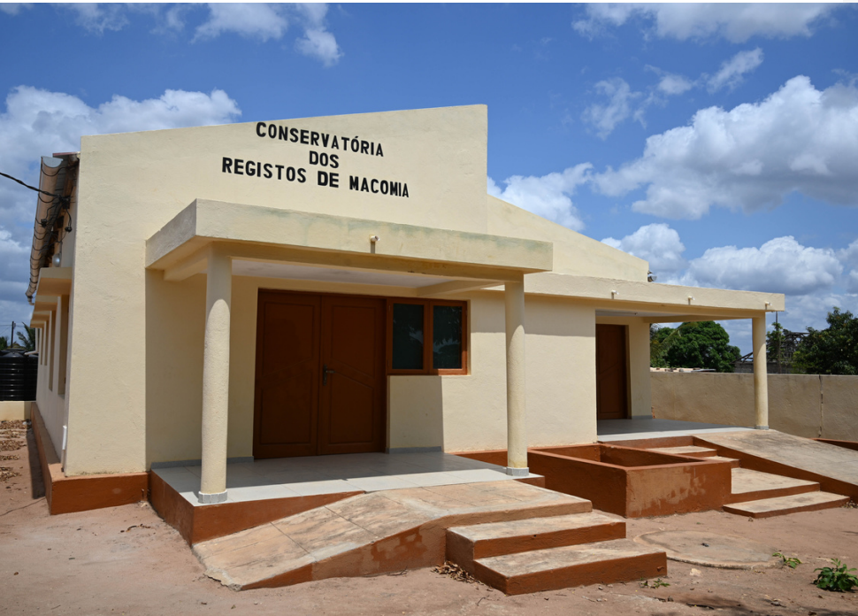
CIVIL REGISTRATION OF MACOMIA