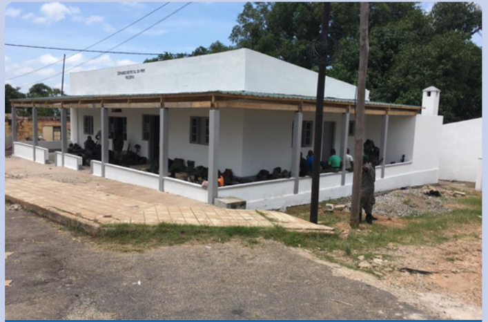
Police Station Macomia